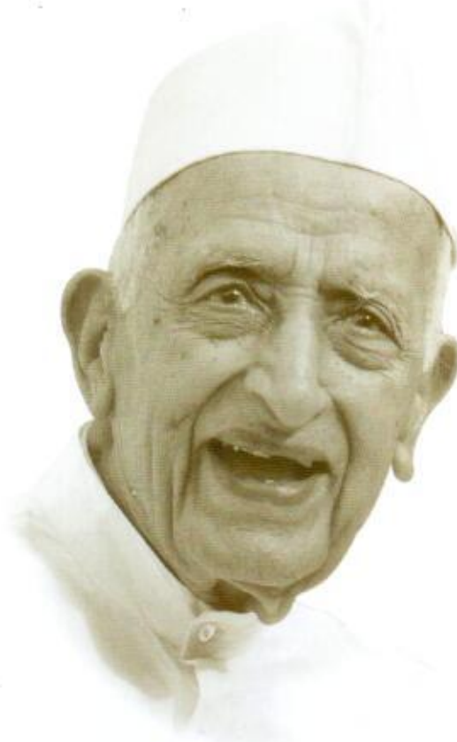
(Late) Padmabhushan Pujya Shriman Karamshibhai Jethabhai Somaiya 16.05.1902 to 09.05.1999